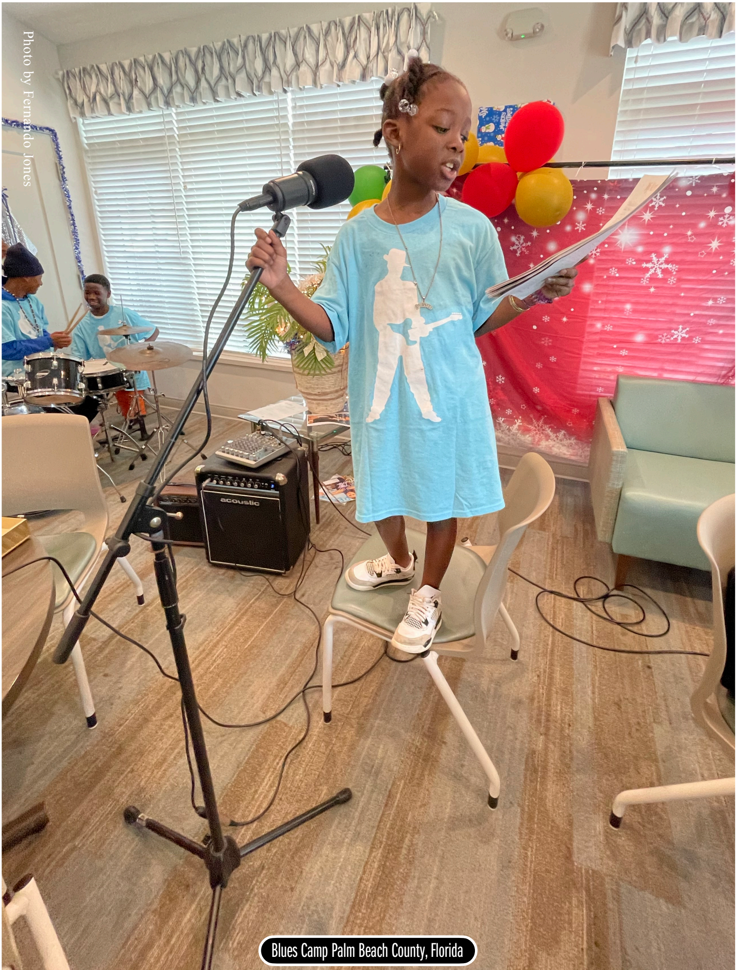
Blues Camp Palm Beach County, Florida