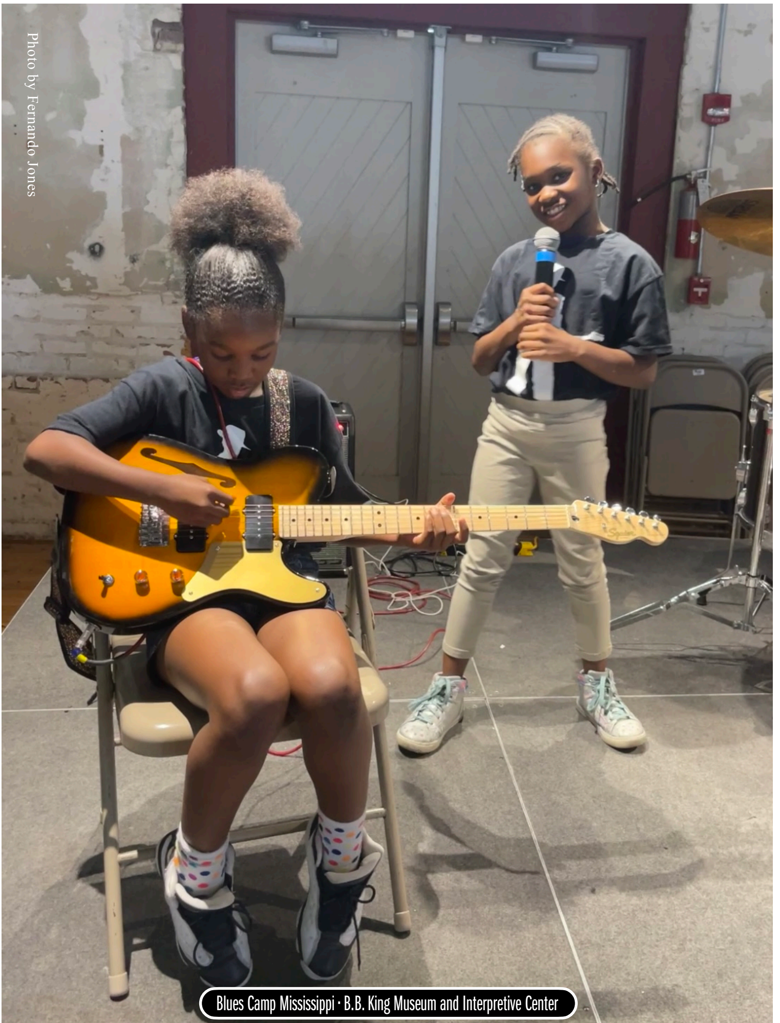
Blues Camp Mississippi · B.B. King Museum and Interpretive Center