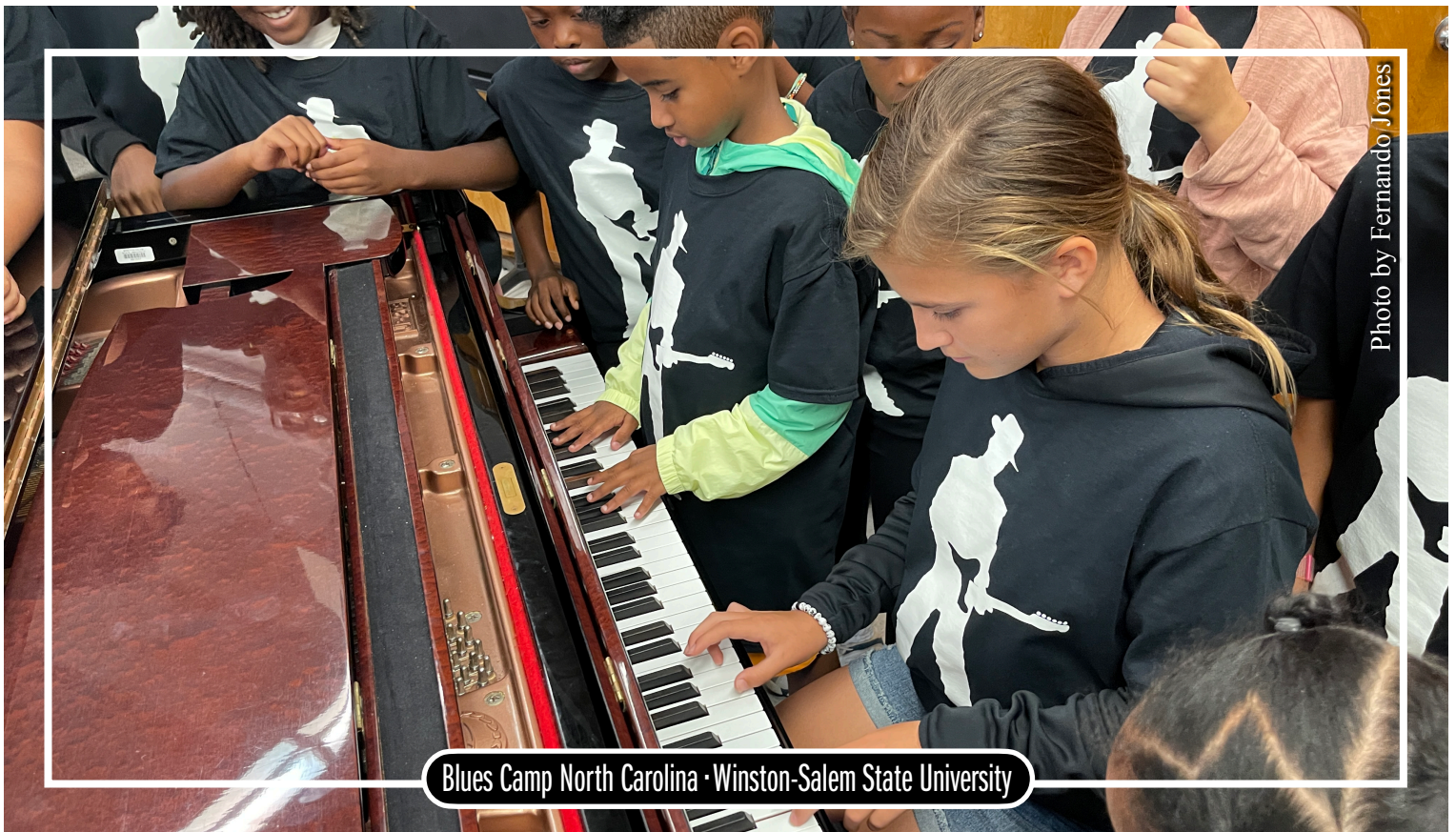
Blues Camp North Carolina · Winston-Salem State University