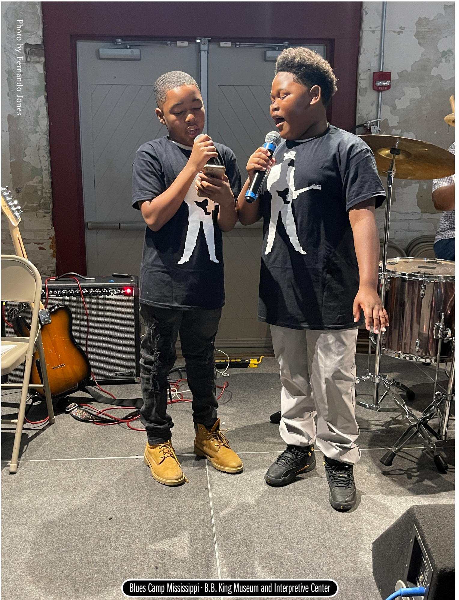
Blues Camp Mississippi · B.B. King Museum and Interpretive Center