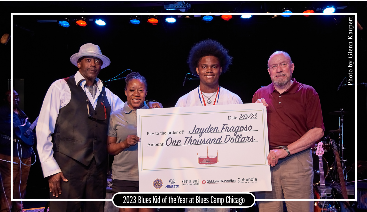
2023 Blues Kid of the Year at Blues Camp Chicago