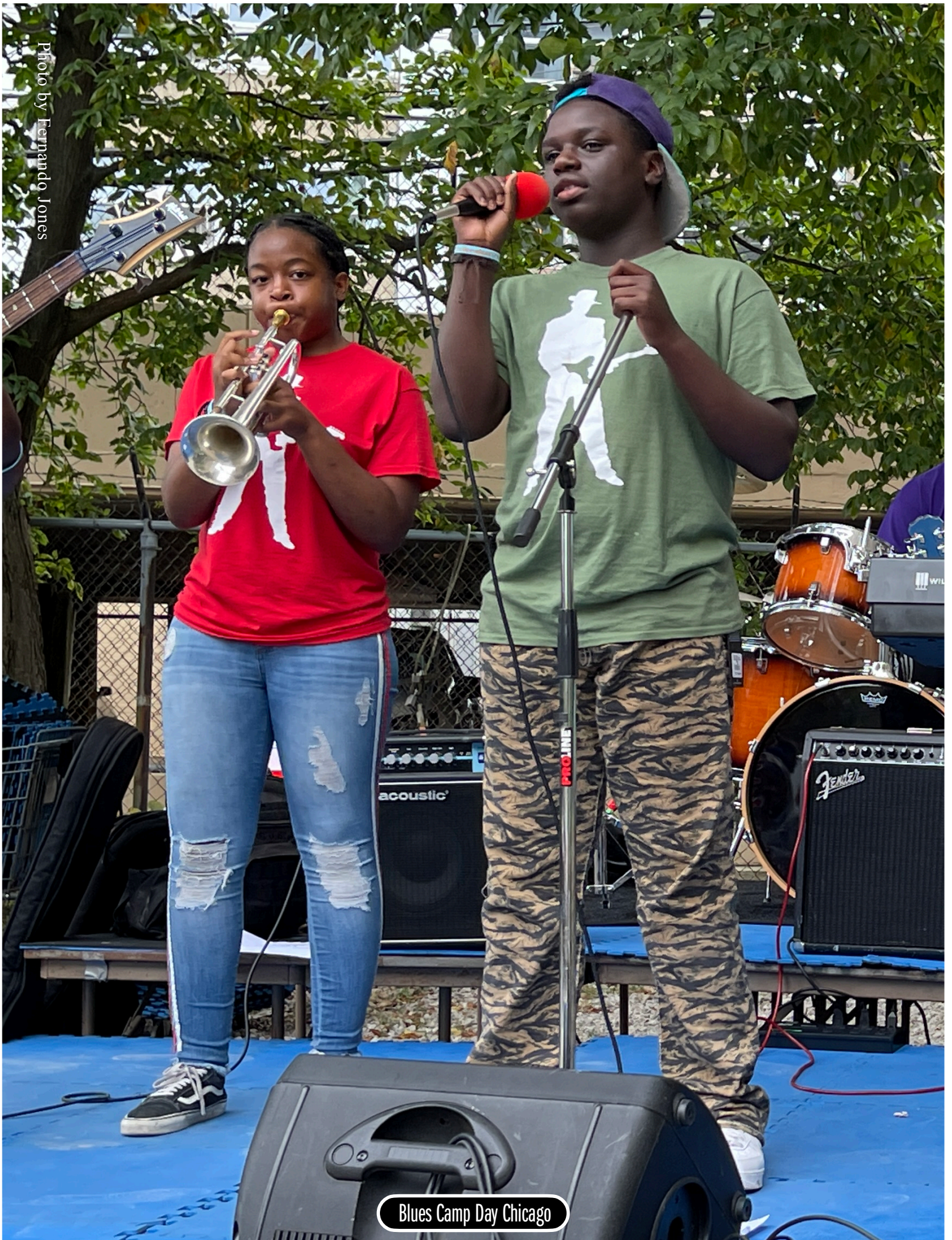
Blues Camp Day Chicago