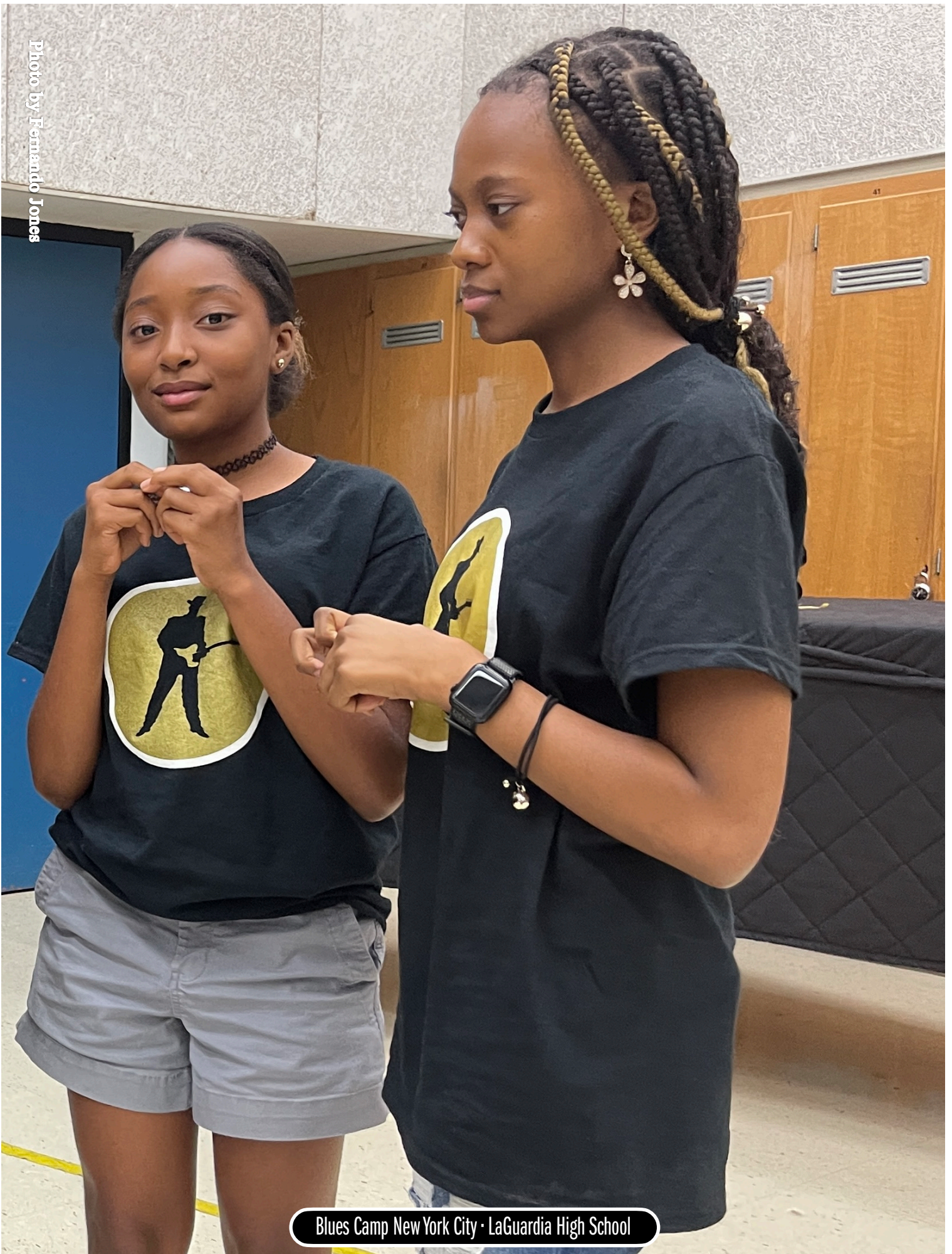
Blues Camp New York City - LaGuardia High School