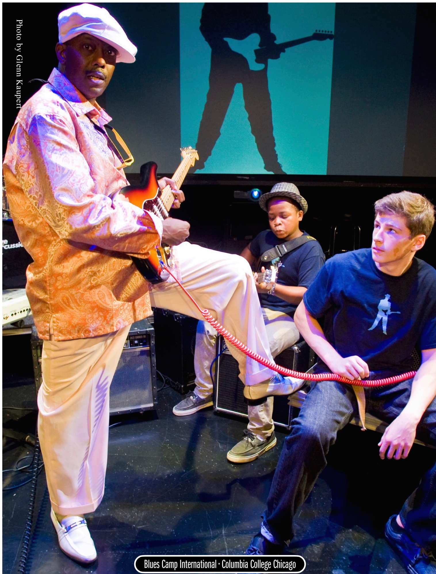
Blues Camp International · Columbia College Chicago